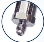
外螺纹 External Thread