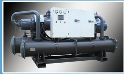
Energy Storage Units