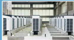
Chilled Water Screw Units