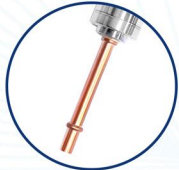
铜管 Copper Pipe

Chilled Water Screw Units / Energy Storage Units Pressure Sensor