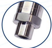
内螺纹 Internal Thread