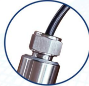
防水出线 Waterproof Cable Outlet